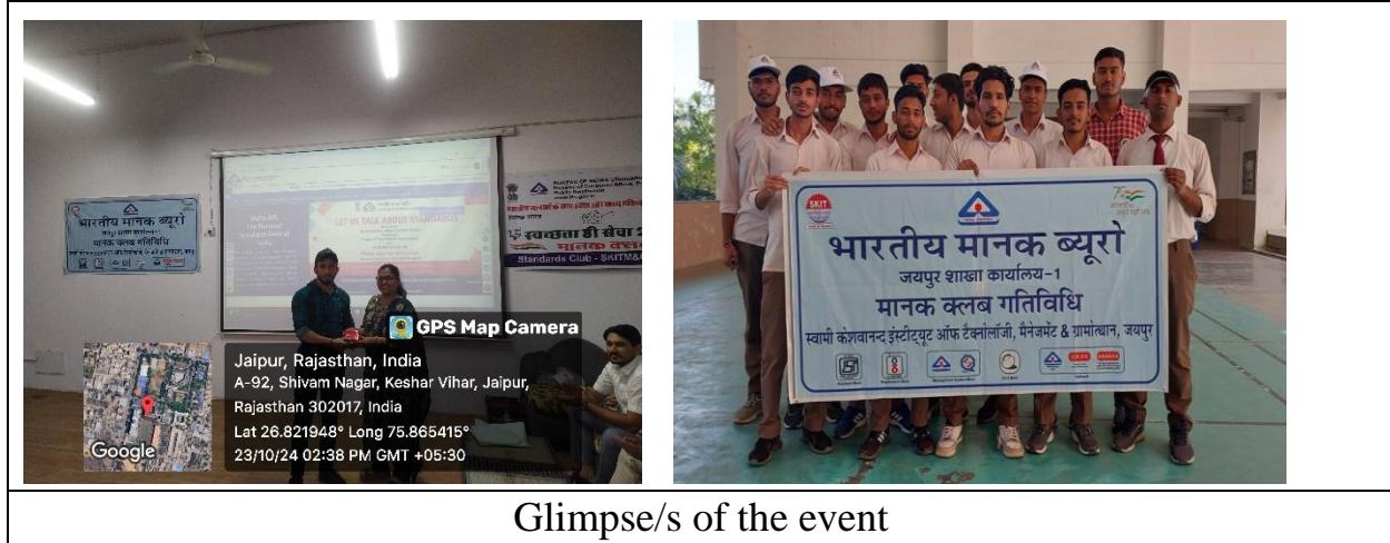
Glimpse/s of the event

Name of the event: Manak Mahotsav- 2024 Date of the event: October 14 th to October 23 rd , 2024 Venue of the event: Campus of SKITM&G, Jaipur